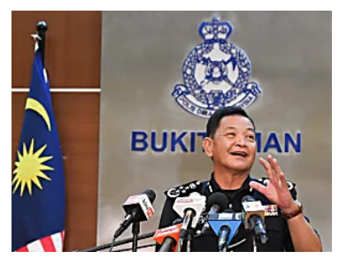
Umno urges MACC to probe outgoing IGP's claims on politicians | New Straits...