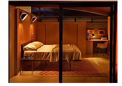
Creating a Smart Bedroom for Better Health and Relaxation