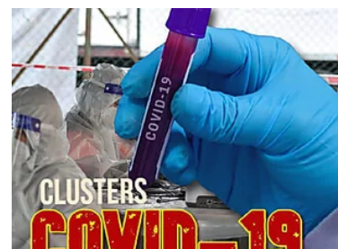
Woman who attended 'kenduri tahlil' triggers new cluster | New Straits Times