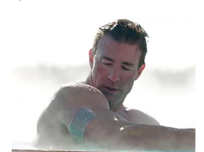
How This "Nanotech Pain Patch" Gives Back Pain Relief